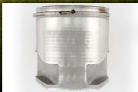
Virtually No Wear/Deposits