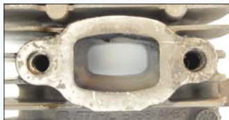
AMSOIL SABER Professional