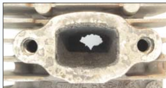
Leading Oil Brand