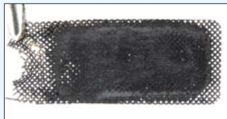
Leading Oil Brand