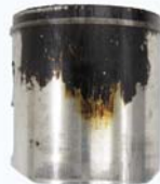
Leading Oil Brand