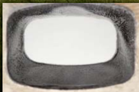
0% Port Blockage

After 600 hours of use in the field, SABER Professional protected Duluth Lawn Care's Stihl** trimmers from carbon deposits.