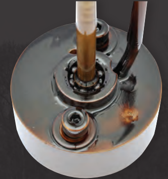
CONVENTIONAL HYDRAULIC OIL (ISO 46)