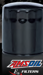
AMSOIL E 3 FILTERS