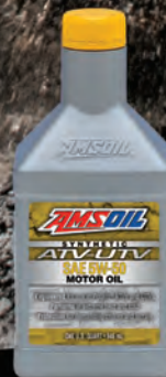
SYNTHETIC MOTOR OIL