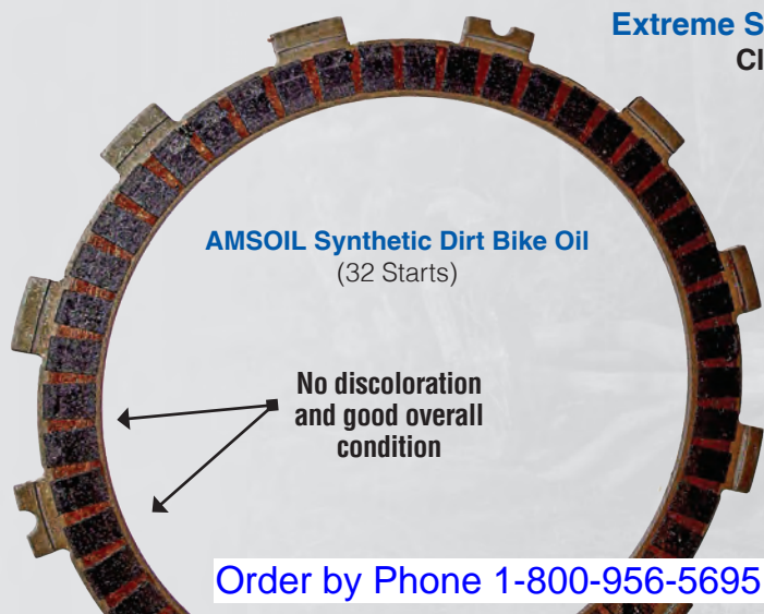
AMSOIL Synthetic Dirt Bike Oil (32 Starts)

No discoloration and good overall condition