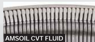
AMSOIL CVT FLUID