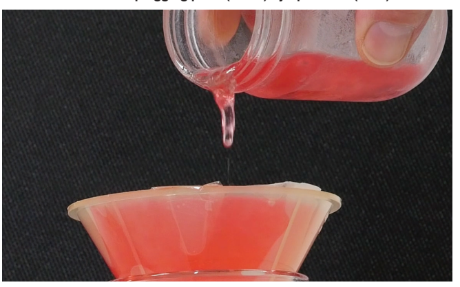
Wax formation in untreated diesel fuel resists pouring.

lowers the cold filter-plugging point (CFPP) by up to 40°F (22°C) in ULSD.